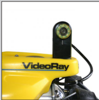
Auxillary Cameras Second POV GoPro