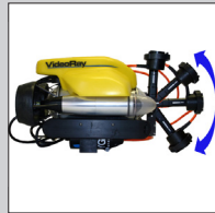
Non Destructive Testing (NDT) Ultrasonic Thickness (pictured) Cathodic Protection Radiation Probe