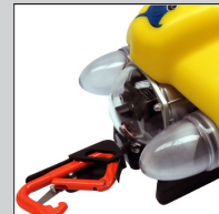
Recovery and Retrieval Tool Kit