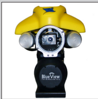
Sonar Blueprint Blueview (pictured) Tritech