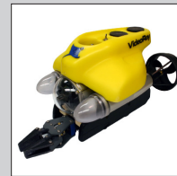
Manipulators Single Axis Rotating (pictured)