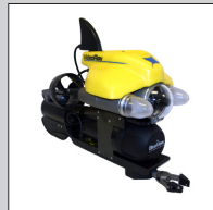
Automation CoPilot RI by Seebyte