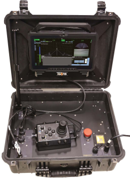
Part Number: 73394