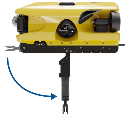
Spring Loaded Manipulator

Features: 1 TB SSD Auto-White Balance Electronic Focus Image Unwarp Digital Pan, Tilt, and Zoom Color Enhancement