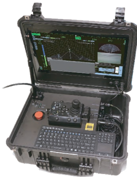
Part Number: 73423