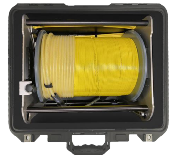
Fiber Optic Tether & Reel