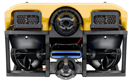
Defender shown with optional Manipulator and Sonar