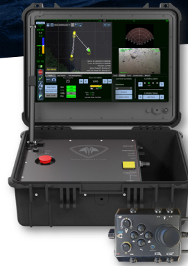
Workhorse Splashproof Controller