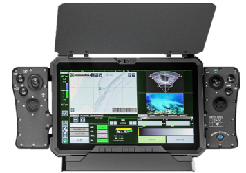
Workhorse Control Console