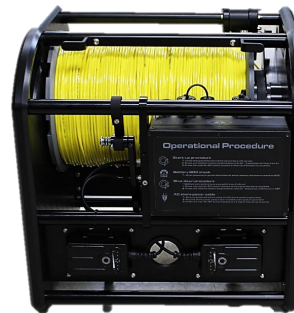
Expeditionary Tether & Reel